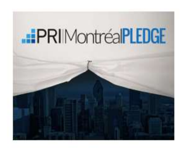
Montréal Pledge MEASURE